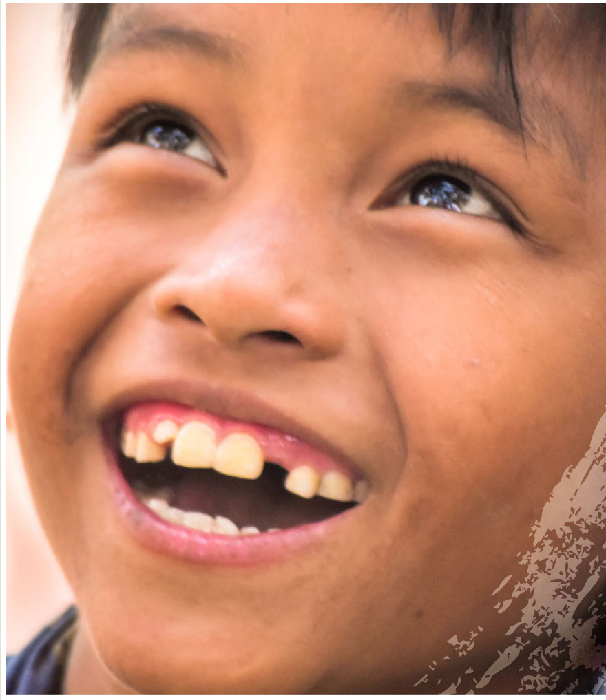
A child from Paethadu Village, Yathae Taung Township, Rakhine\RYNG

RYNG | Supporting Displaced Children in Rakhine